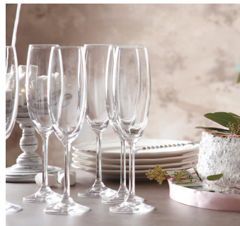
Manually raise or lower the upper rack for large casserole dishes or tall stemware.