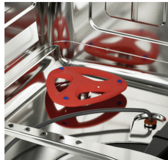
Place your most soiled pots and pans near the third sprayer for extra scrubbing power with Power Wash.