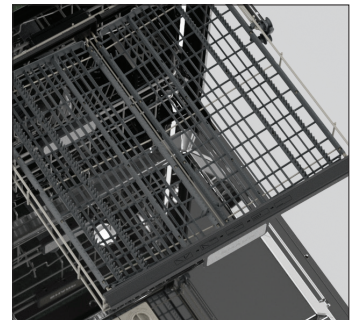
The adjustable third rack is ideal for flatware and serving instruments such as spatulas and other baking utensils.

SHARP ELECTRONICS CORPORATION 100 Paragon Drive, Montvale NJ, 07645 1.800.237.4277 • www.sharppusa.com