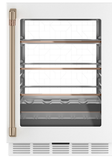
CCP06BP4PW2 Matte White with Brushed Bronze handles